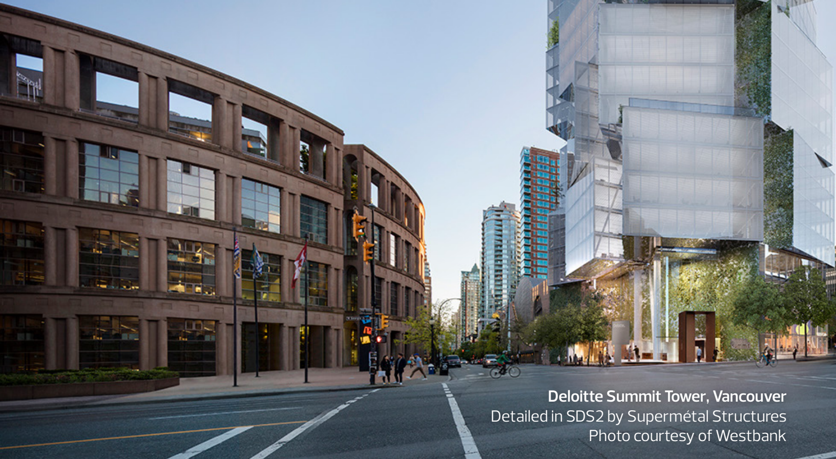
Deloitte Summit Tower, Vancouver Detailed in SDS2 by Supermétal Structures

Drive efficiency and profitability for your projects with SDS2 by ALLPLAN, the only steel detailing software with all-in-one intelligent connection design.